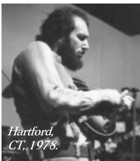
Hartford, CT, 1978.